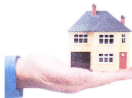
Careful planning when downsizing